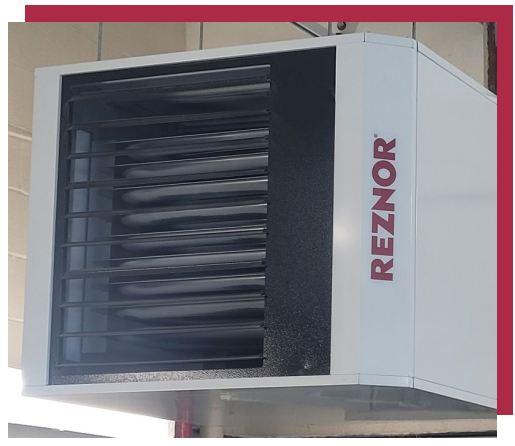
Ongoing HVAC repairs and replacements in 2022!