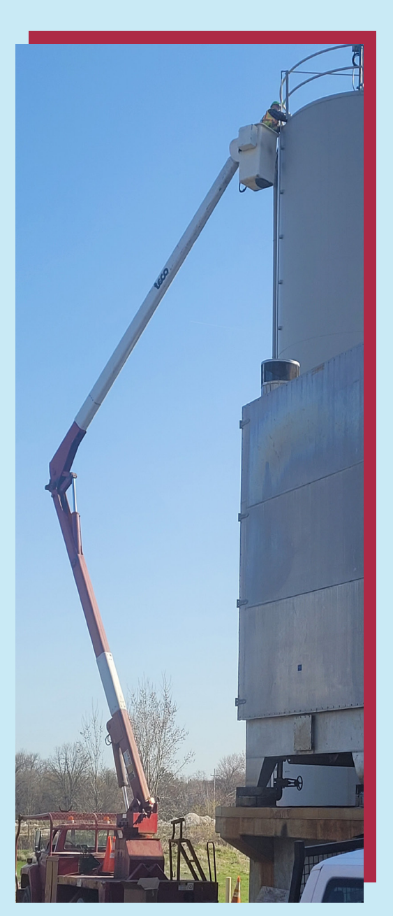
Service and replacing equipment using the DPW tree truck!