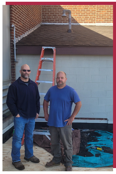
Saving funds by staff replacing a shingle roof.

ND: not detectable at testing limit ppb: parts per billion or micrograms per liter ppm: parts per million or milligrams per liter Treatment Technique (TT): A required process intended to reduce the level of a contaminant in drinking water.