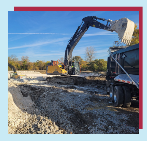
Contractors remove lime at an average annual cost over $250,000,00

Due to a Level 1 Assessment being two days overdue, the state considered this a Treatment Technique Violation. Also the number of required samples of well water was short by one sample. This was considered a Groundwater Monitoring Violation. The City of Owosso Water Supply became out of compliance on November 13, 2022, and returned to compliance on November 14, 2022, when the completed L1A form was submitted to EGLE. Additional details and explanation of this event leading up to the Violations were included in an insert in the January 2023 quarterly water bill mailing as required by the state.