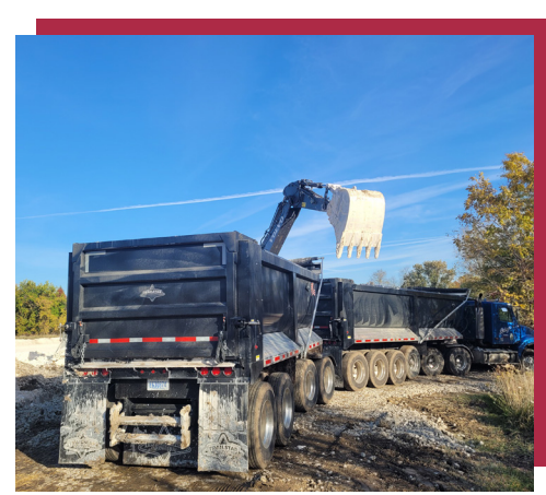
Each year used lime sludge is removed for beneficial use on farm fields.