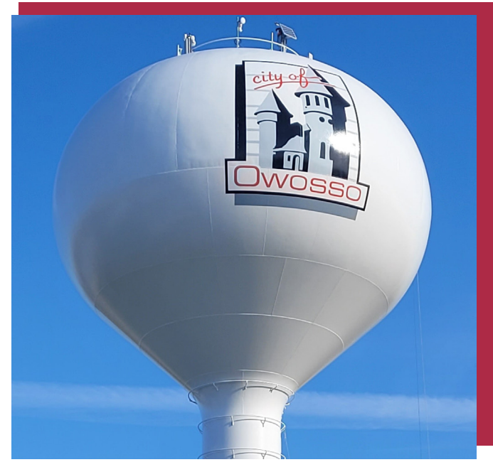
The newly painted West Tower!

Maintenance at the water plant is a continuous exercise. There are many parts and pieces of equipment that make up the different processes. All of the equipment has an expected useful life which we try to prolong with preventive maintenance. Our Asset Management Plan and Capital Improvement Plan guides us on when to repair/replace more expensive items and how to budget for them. During 2022, as part of a State Drinking Water Revolving Fund (DWRF) loan project, the City completed a rehabilitation of the Standpipe and the West Tower. Both tanks required component upgrades in design due to code changes. Also this work included the installation of mixers. The 24/7 operation of mixers will improve water quality, improve disinfection and prevent damage during winter due to freezing.