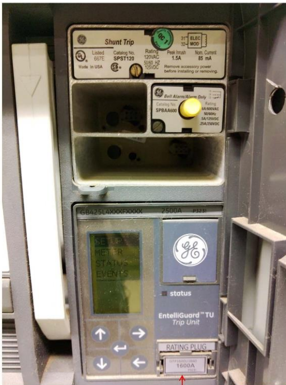
Note 1600A Plug